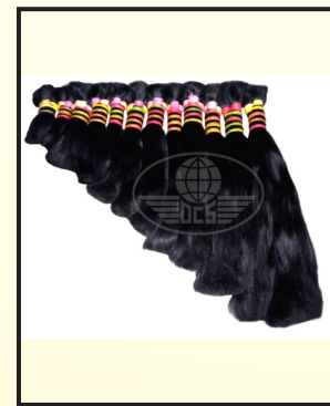
All in 1